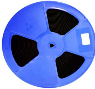
13 Packaging and taping diagram

As shown in the figure below, the packaging of Ra-01S-P is braided tape, 800pcs/reel. As shown in the figure below: